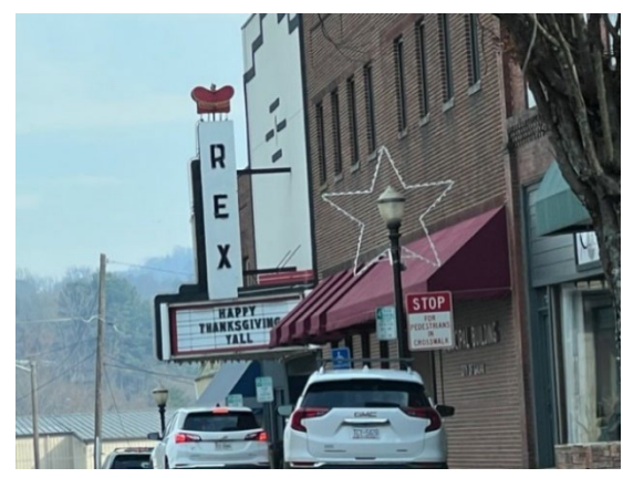
Potential DHR Grant for Rex Theater

The goal of the subgrant program is to fund approximately three (3) historic building rehabilitation projects in the region at approximately $200,000 each. Buildings eligible for these funds must be listed in, or eligible for listing in, the National Register of Historic Places and must be owned by a public entity or non-profit organization. Eligible subgrant projects will involve buildings with a public function, including, but not limited to, museums, theaters, and historic sites. Council authorized Staff to develop an application for potential renovations to the Rex Theater.